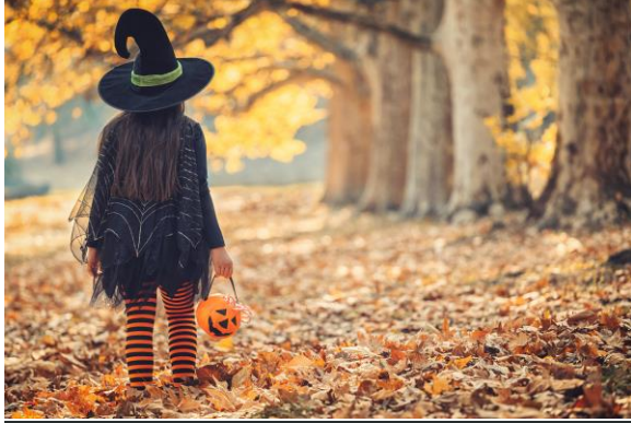
Trick or Treat